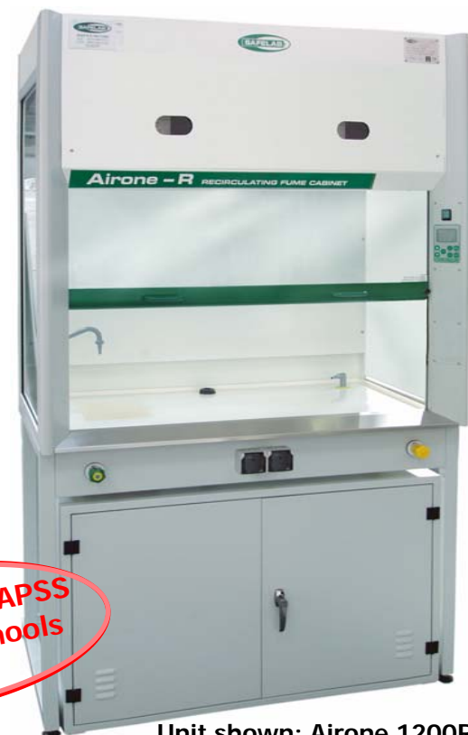
Unit shown: Airone 1200R with optional storage cabinet