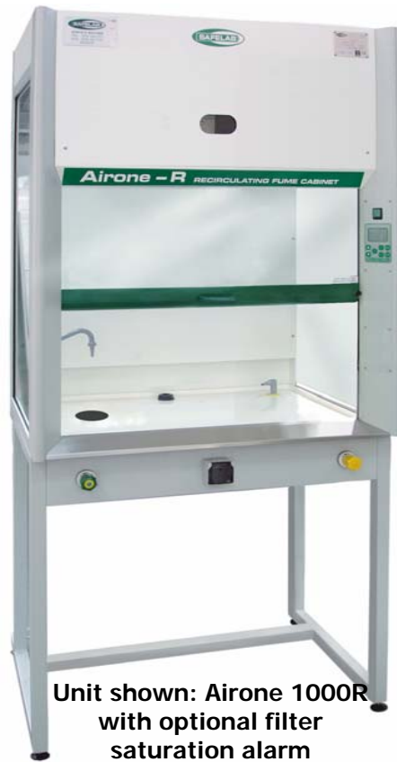
Unit shown: Airone 1000R with optional filter saturation alarm