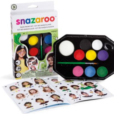
Object of the declaration.