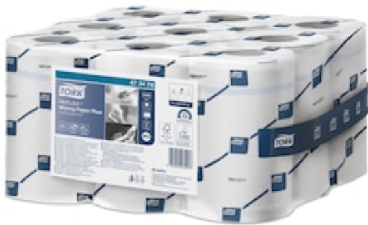
Tork Reflex™ Wiping Paper Plus M3 473474