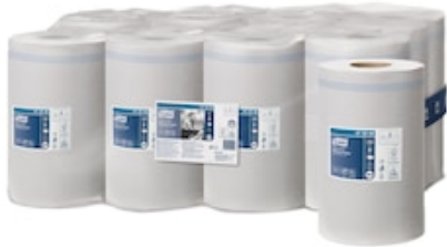
Tork Reflex Wiping Paper M3 473246