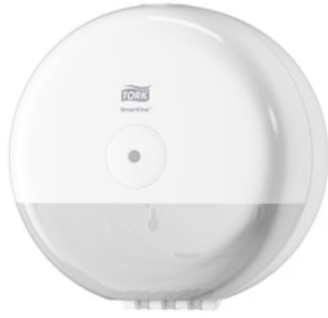
Tork SmartOne Mini TR Disp White 681000