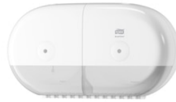
Tork SmartOne Twin Mini TR Disp White 682000