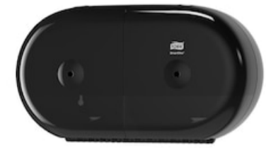
Tork SmartOne Twin Mini TR Disp Black 682008