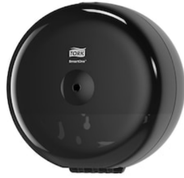
Tork SmartOne Mini TR Disp Black 681008