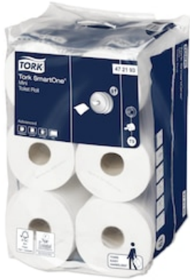
Tork SmartOne Mini TR Adv 2p 620s 472193