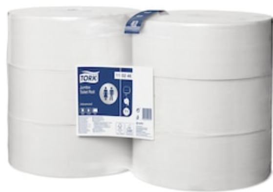
Tork Jumbo TR Adv 2p 340m 76core 110246