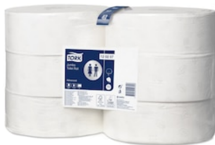
Tork Jumbo TR Adv 2p 360m 120257