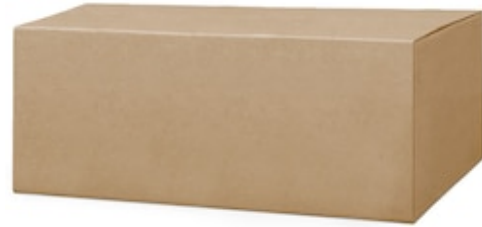
Jumbo TR Neut 2p 400m 59core 508342