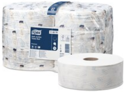
Tork Jumbo TR Prem 2p 360m 110275