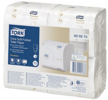
Tork Folded Toil Paper Prem 2p 252s C&C 620275