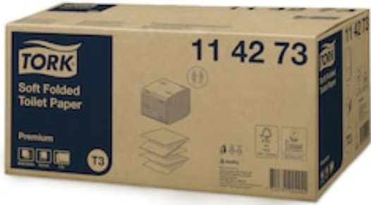
Tork Folded Toilet Paper Prem 2p 252s 114273