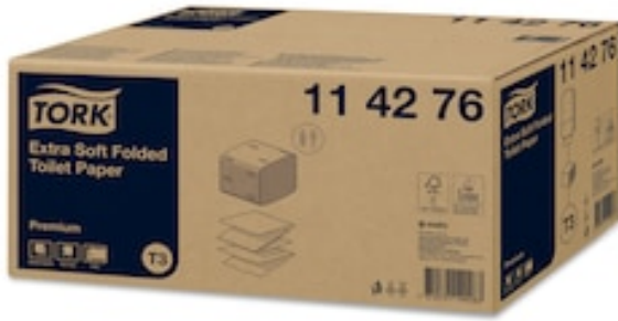
Tork Folded Toilet Paper Prem ES 2p 252s 114276