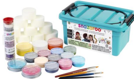
Object of the declaration.