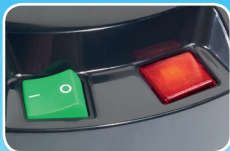
On / Off power indicator