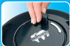
10m cable rewind and storage