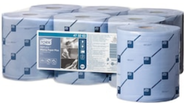
Tork ReflexWip.Paper Plus Blue M4 2ply 473263