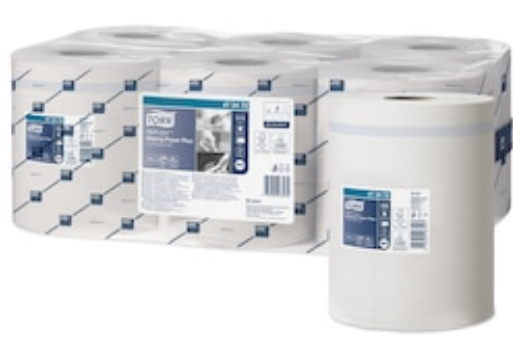
Tork Reflex Wiping Paper Plus M4 473472