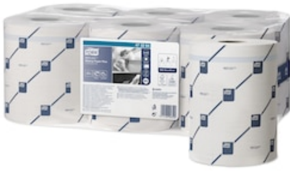
Tork Reflex Wiping Paper Plus M4 2ply 473264