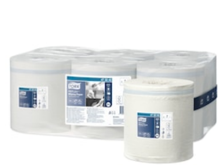
Tork Reflex Wiping Paper M4 473242