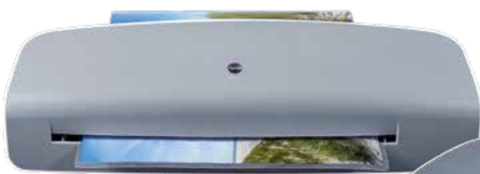
1: A4 LAMINATOR (OL 250-L-17)