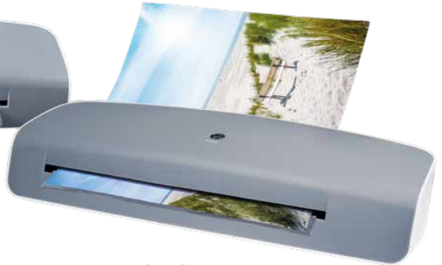
2: A3 LAMINATOR (OL 350-L-17)