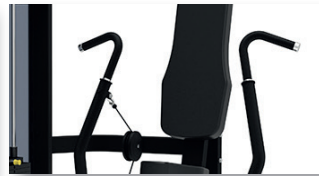
Dual Hand Grips