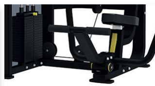
Assisted foot support