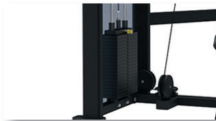
Easy Weight Selection