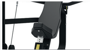
30 degree tilted seat