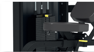
Easy Weight Selection