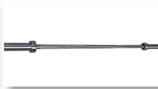
30mm Diameter Grip