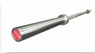
Available in 5, 6 & 7ft