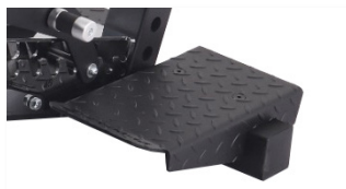
Integrated Spotting Platform