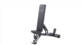
85 Degree Sit-Up Position