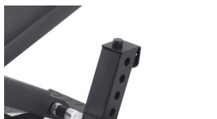
Welded Support Bar