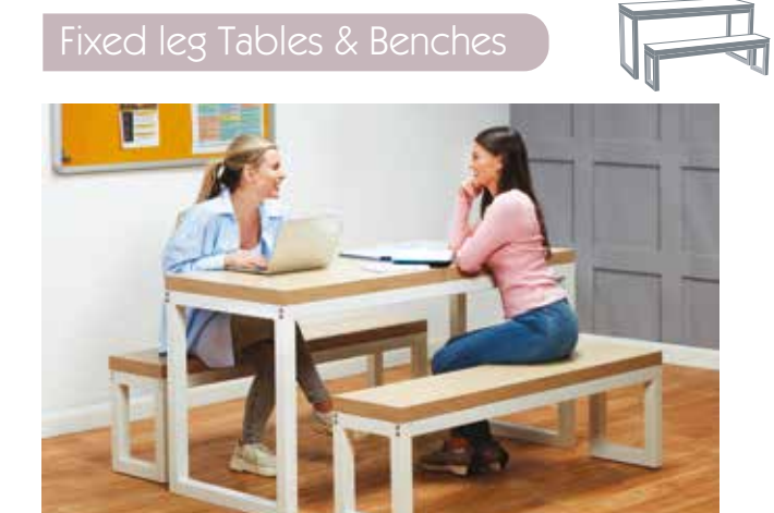
Table and Bench Colour Options