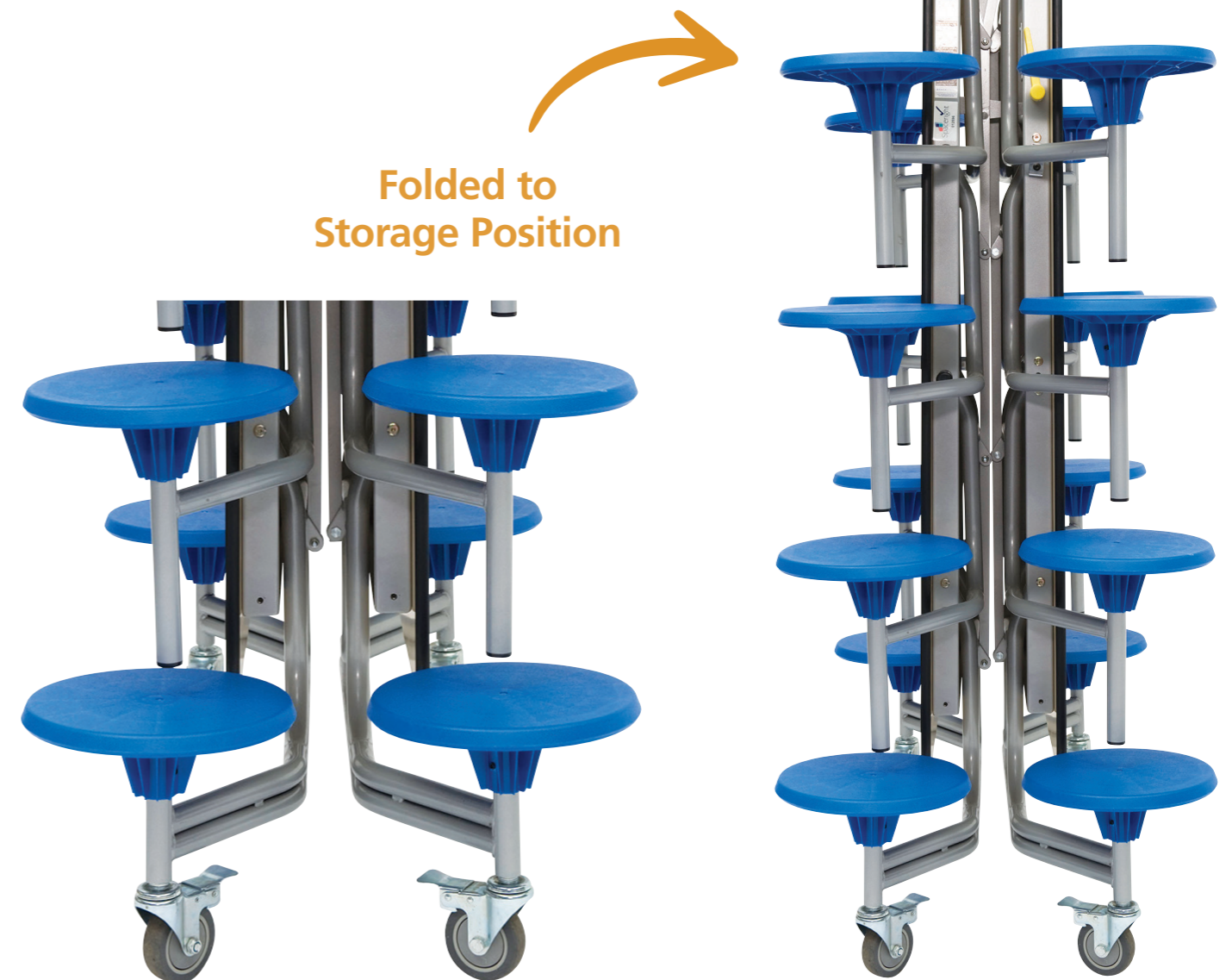
Folded to Storage Position